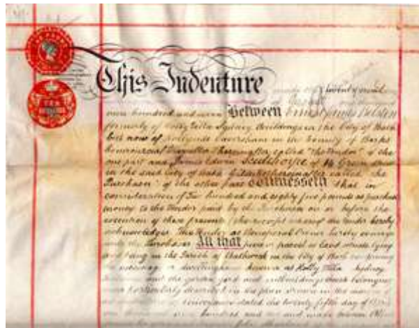
The 1907 Conveyance