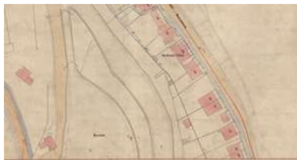
Section of the 1852 Map

The 1852 map shows the same buildings on the plot as the 1840 Tithe map.