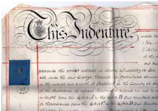
The 1837 Indenture