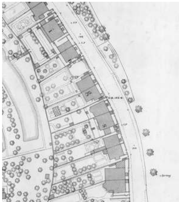
Section of the 1886 Map