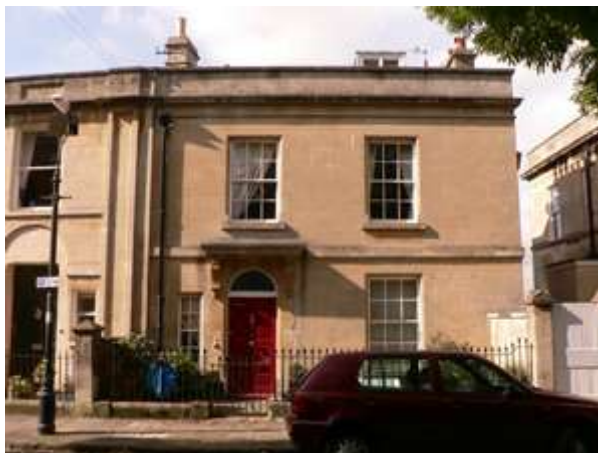
No 47 today

Seven of the original documents, dated from 1837 to 1907 , relating to the acquisition of the plot and subsequent ownership of what is now No 47 are still in existence, including a 1901 Abstract of Title.